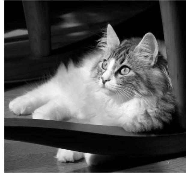
Elsa, 2009 Best in Show ~ Carol Nordling

Enter your favorite photo in Average Joe Cat Show photo contest. More than a dozen fun categories! Submit your photo in as many categories as you'd like!